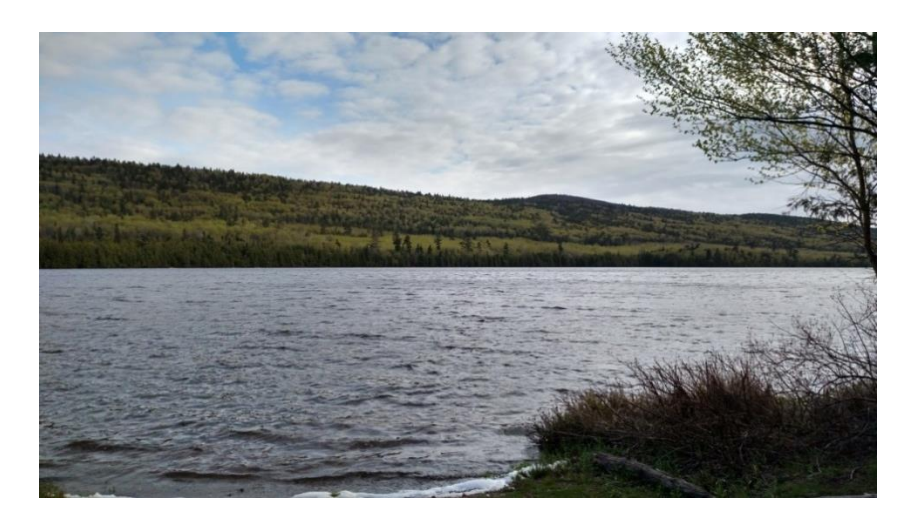
Lake Bailey, Lake Medora, and Thayers Lake all have state owned boat launches. Each site is equipped with a dock and restroom facilities.

There are several State-owned marinas and harbors of refuge in Keweenaw County located. Eagle Harbor, Copper Harbor, and Lac La Belle are all harbors of refuge for mariner traffic. Each also has a state owned Marina. Copper Harbor and Lac La Belle were upgraded in 2002 and 2010 respectively.