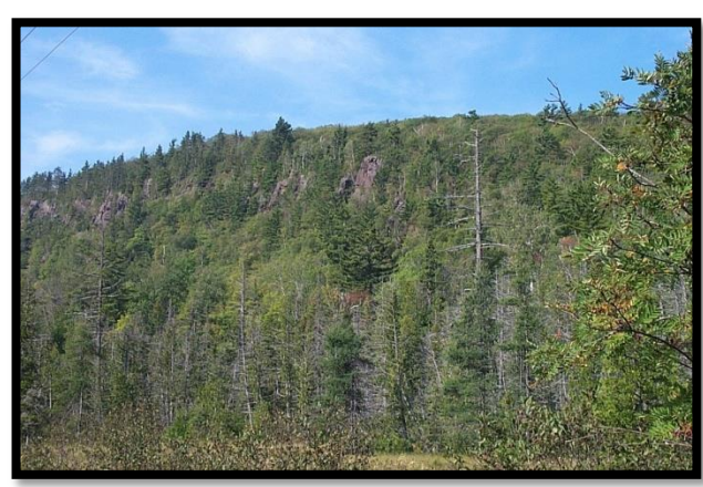
Marsh area below the Cliffs

Land and water resources are the foundation of Keweenaw County. Because natural features are interrelated and disturbance in