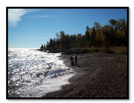
Rock picking at High Rock Bay

Section 1 documents and evaluates the existing conditions within the County and identifies issues and opportunities throughout the County. This section of the plan is followed by a Vision for Keweenaw County (Section 2) and Plan Implementation (Section 3).