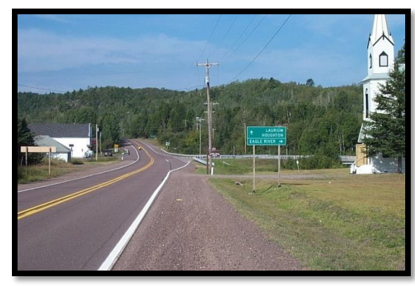
US 41 Phoenix

Allouez Township (Allouez, Mohawk, Fulton,