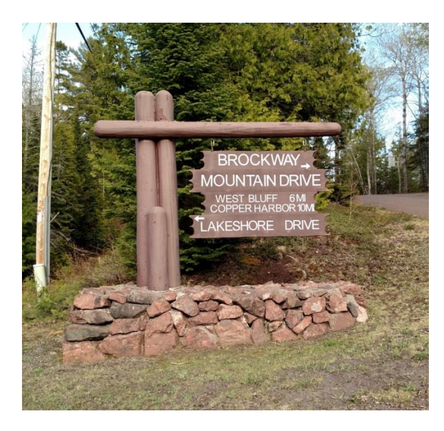
M-26 Eagle Harbor

Almost all of the Township's nearly 55-square mile area is commercial forest, with settlements located along the Superior coastline and around the Township's inland lakes. Eagle Harbor, an historic mining and commercial fishing port, is the Township's largest community with an estimated 45 percent of the Township's permanent households and nearly 40% of the seasonal households located there. Other major settlements are located around Agate Harbor and Gratiot Lake, both being dominated by seasonal dwelling units.