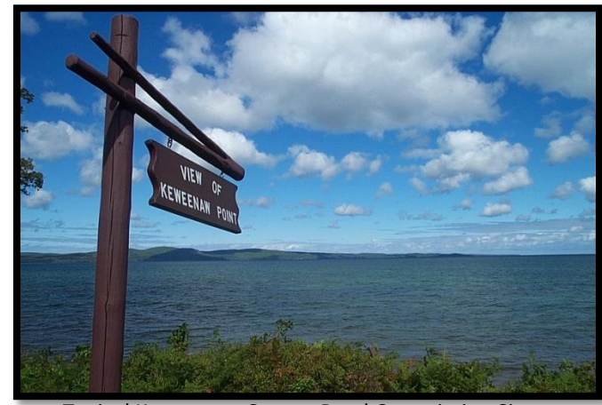
Typical Keweenaw County Road Commission Sign

Other signage is typical of Michigan roadways, including traffic signage, Scenic Michigan signs, and business signage. The zoning ordinance