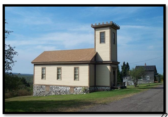
Central Mine Church

Central Mine Methodist Church- the church was once the civic center of the mining company