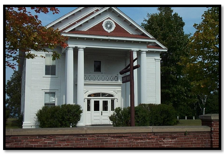
Keweenaw County Courthouse Eagle River

including the Village of Ahmeek, and Sherman the smallest with only 67 persons. Each maintains a Township Board, but due to limited resources, planning and zoning activities are carried out by the Keweenaw County Planning and Zoning Commission in all but Eagle Harbor Township. The Village of Ahmeek has its own council and relies on the County for zoning enforcement.