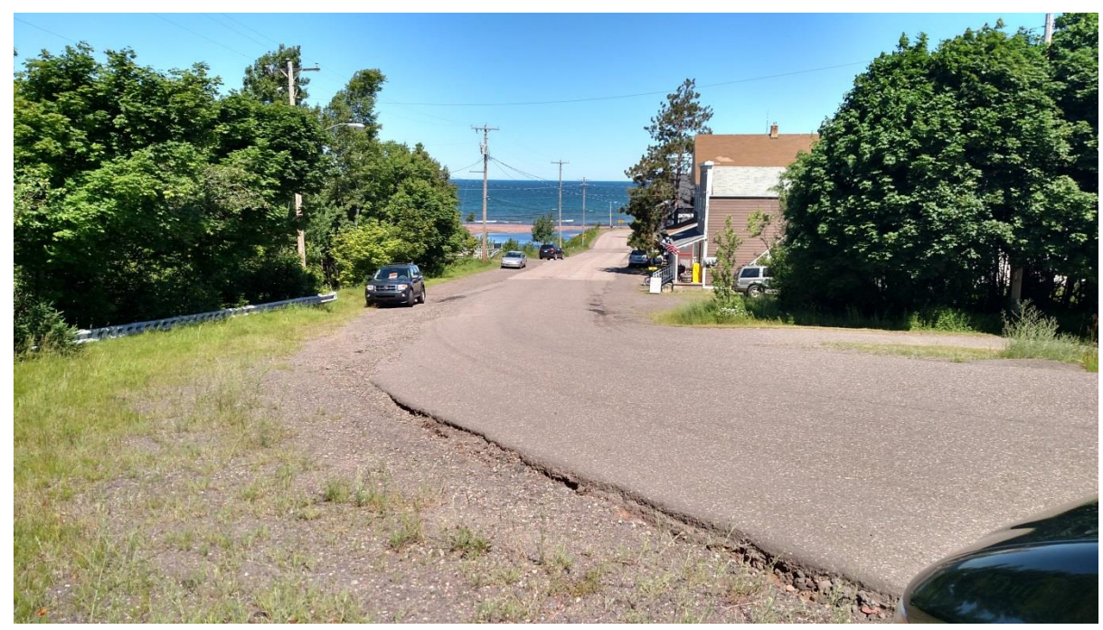
Main Street Eagle River

As projections were based on the economic trends of a locality, fertility and mortality, they are very difficult to predict. It should be anticipated that the trend to relocate to rural communities such as Keweenaw County will continue, resulting in population increases contrary to the 1996 projections.