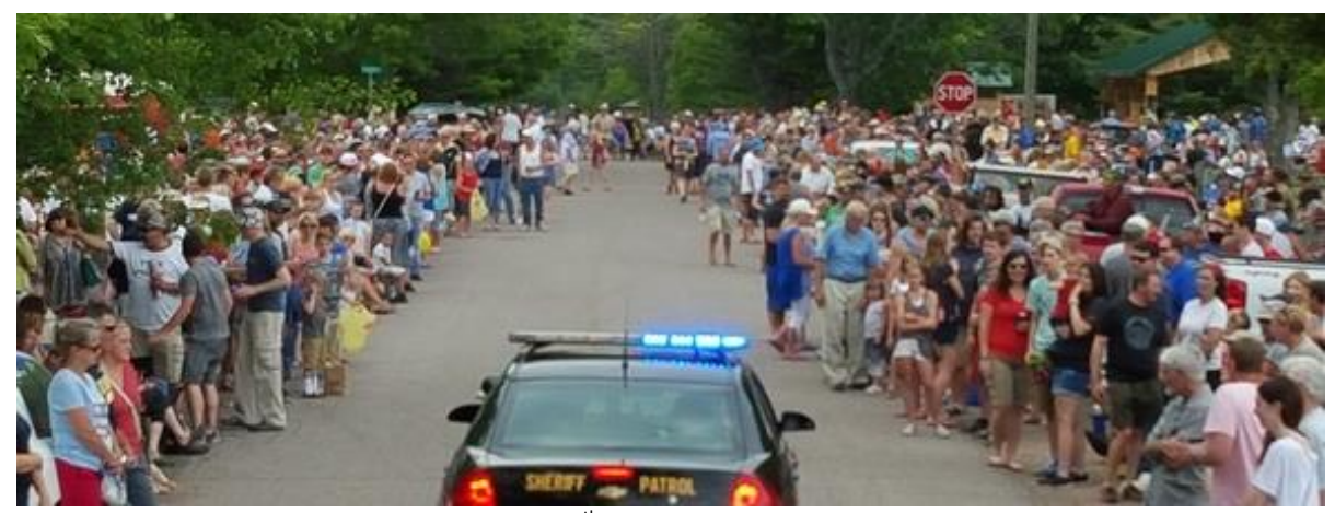
July 4<sup>th</sup> Parade in Gay

<u>Issue – Decreasing Ad-Valorum Tax Base:</u> With the increasing number of tax exempt organizations preserving the Keweenaw, the ad-valorum rolls continue to diminish. The need for public safety does not decline with private ownership. The Township must maintain fire protection and the County must maintain Law Enforcement with the reduction in tax base.