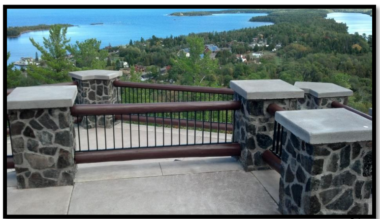
Brockway Mountain overlooking Copper Harbor

Eagle Harbor. The drivable route is easily the most accessible, high-elevation (720 feet above Lake Superior) viewpoint in the County, providing panoramic views of the area. It is the highest elevation from the drive between the Rockies and the Alleghenies. The road parallels the bluff line and is edged by a rock fence line for most of its length.